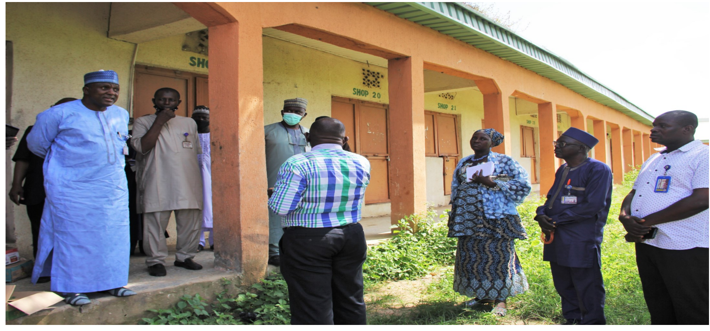
The VC, Prof. Bala addressing the Committee members during the inspection tour.